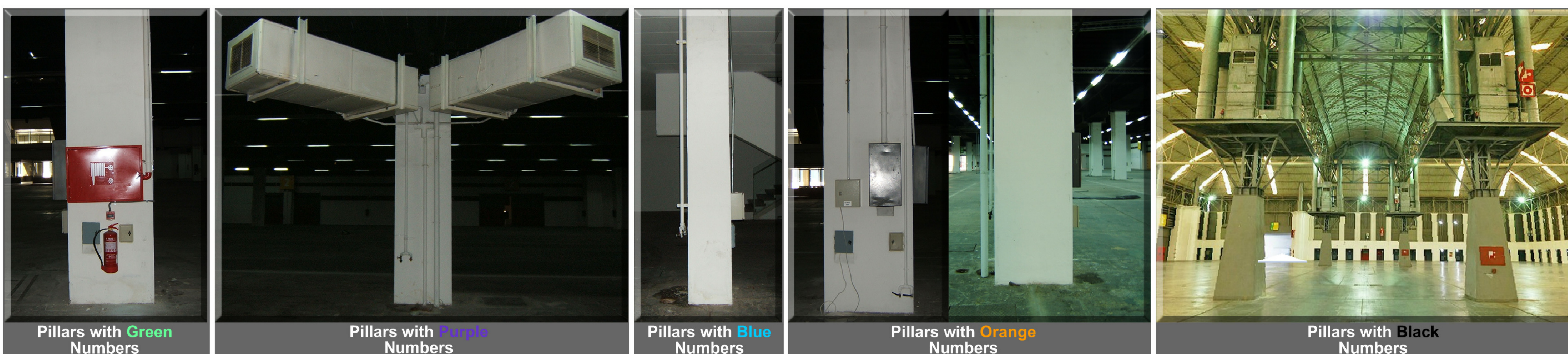
Pillars with Green Numbers